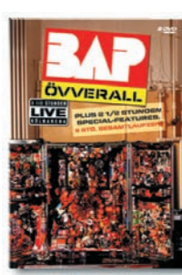
BAP: Övverall (live recordings)