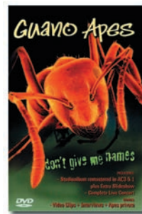
Guano Apes: Don't give me names (Strings)