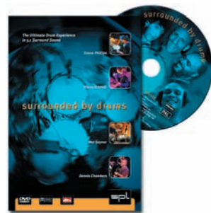
SPL: Surrounded By Drums Featuring Simon Phillips, Mel Gaynor, Dennis Chambers and Kenny Aronoff