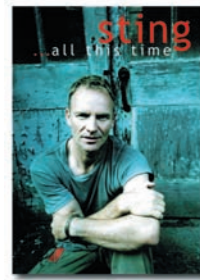
Sting: All this time (live recordings)