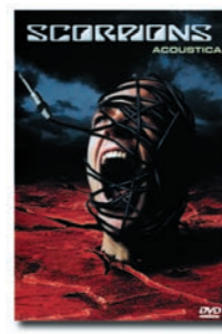
Scorpions: Acoustica (live recordings)