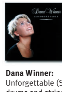
Dana Winner: Unforgettable (SACD, drums and strings)