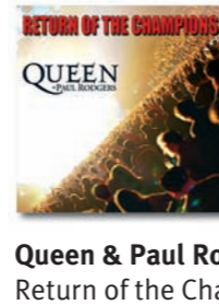
Queen & Paul Rodgers: Return of the Champions (live recordings)