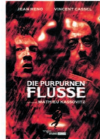
The Crimson Rivers Motion picture soundtrack