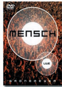
Herbert Grönemeyer: Mensch Live (live recordings)