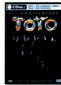
Toto: Live in Amsterdam (live recordings)