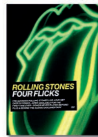
Rolling Stones: Four flicks (live recordings)